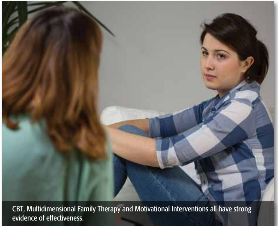
CBT, Multidimensional Family Therapy and Motivational Interventions all have strong evidence of effectiveness.

There are many effective community-based treatments for substance use disorders, so practitioners should choose one that most suits the young person.