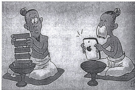
Drawing 2 Tablet Vs. Palm-leaf Manuscript (Theme Globalization). A social phenomenon of how a technology interfered with a spiritual activity which is generally conservative and traditional in nature. Source: the Bog-Bog Cartoon Magazine No. 5 Vol. 10 of 2011.

As anticipation to the cultural change, the Balinese people welcome and adopt changes flexibly and selectively (Geriya, 2000). Drawing 2 showed two priests "mangku" who were reading holy books. One was reading the palm leaf manuscript and the other was using a tablet. Such a phenomenon showed that the Balinese people were in the transformational process; the traditional mechanical tool was being replaced by the modern mechanical tool.