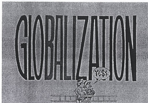
Picture 1. Globalization.

It cannot be denied that globalization in Bali is enthusiastically welcome by people. In Picture 1 the word "globalization" was intentionally written in red, indicating a condition in which we should be on the alert. It also indicated a danger and reminded us that Bali had been exploited within the discourse on globalization. Under the word 'globalization' two people were seen to represent the local people who enthusiastically said "Yes" (the dollar currency was the character). They were bringing subjugated commodities, implicitly meaning that they enthusiastically went up the economic ladder or the economic improvement.