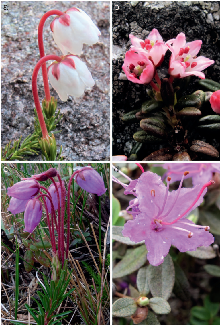
Figure 2. Four state-threatened alpine plants documented on Katahdin in Baxter State Park, Maine. A. Harrimanella hypnoides (L.) Coville; B. Kalmia procumbens (L.) Gift, Kron, & P.F. Stevens ex Galasso, Banfi, & F. Conti; C. Phyllodoce caerulea (L.) Bab.; D. Rhododendron lapponicum (L.) Wahlenb.