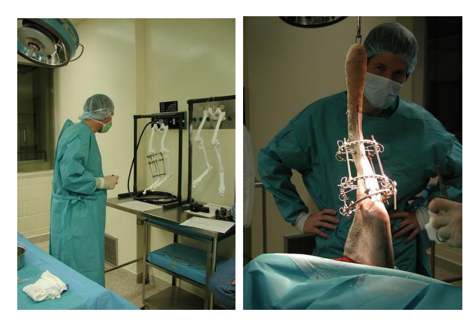
Figure 5 – Biomodels in the OR (L) and Attached Ring Fixator (R)

The next day, the German Shepherd was prepared for surgery, and the surgical team was briefed about the planned procedure using the biomodel. Two models were used in surgery as references - the one with the frame and one that was untouched. The surgeon performed the surgery following the exact procedure rehearsed the previous day and frequently consulted the models for additional information.