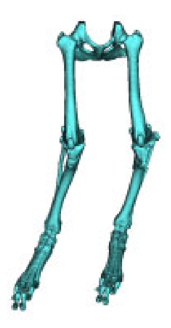
Figure 2 - 3D-model dog's pelvic limbs created using Mimics

To fabricate the model, an SLA-190 from 3-D Systems was used with a build envelope of 190 x 190 x 250 mm. Due to the shift in the tibial portion of the computer model, the computer model was separated into two sections that were exported to the STL file format. To fit the model onto the relatively small build platform, the STL files were imported into Geomagic Studios by Raindrop Geomagic [9] and divided into a total of 11 sections. Three build platforms were prepared using the Lightyear software from 3D Systems, and the build style was set to QuickCast to save time, resin and laser hours. Three sets of solid models were requested by the surgeon to plan and rehearse the surgical procedure. One model was to be used to plan the complicated surgery. The second model was to be kept for reference in the operating room. The third model was created just in case an extra model was needed during the pre-surgical planning session. In order to produce the three models, one-piece RTV silicon rubber molds were needed to produce the different bones. The three sets of bones were produced, assembled, finished and painted to give a natural look (Figure 3).