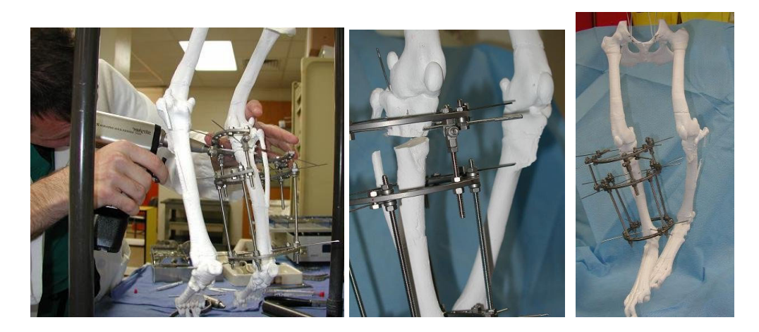
Figure 4 - Pre-surgical rehearsal on biomodel

The right pelvic limb was operated on first. Based on the radiographs and the images from the CT-scan, the surgeon had anticipated performing one femoral and two tibial osteotomies to correct the deformities of the right pelvic limb. When the models were presented to him, it was concluded that only the tibial osteotomies would be needed. The pre-surgical rehearsal was performed the day before surgery. The original plan was to perform and opening wedge osteotomy and to use an hinged circular external fixator to correct the proximal end of the tibia. A closing wedge osteotomy with a fixating plate was to be used to correct the distal end of the tibia. After working with the model for some time while designing and assembling the external ring fixator, the surgeon decided to correct the deformity by only performing one osteotomy using the external ring fixator at the proximal end of the tibia. Using the model, it was concluded that a medial angular correction of 22 degrees was needed along with a medial rotational correction of 11 degrees. Following assembly of the ring fixator, the entire surgical procedure was performed using one of the models, and notes were taken to assist the actual surgery the following day.