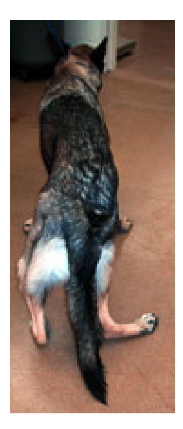
Figure 1 - Rear View of German Shepherd Showing Bone Deformities