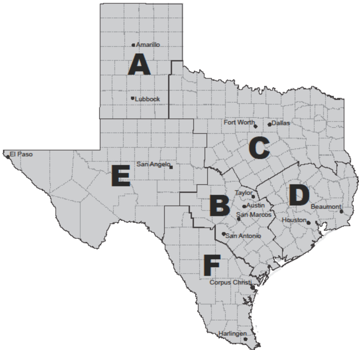
Figure 2. Interview field sites