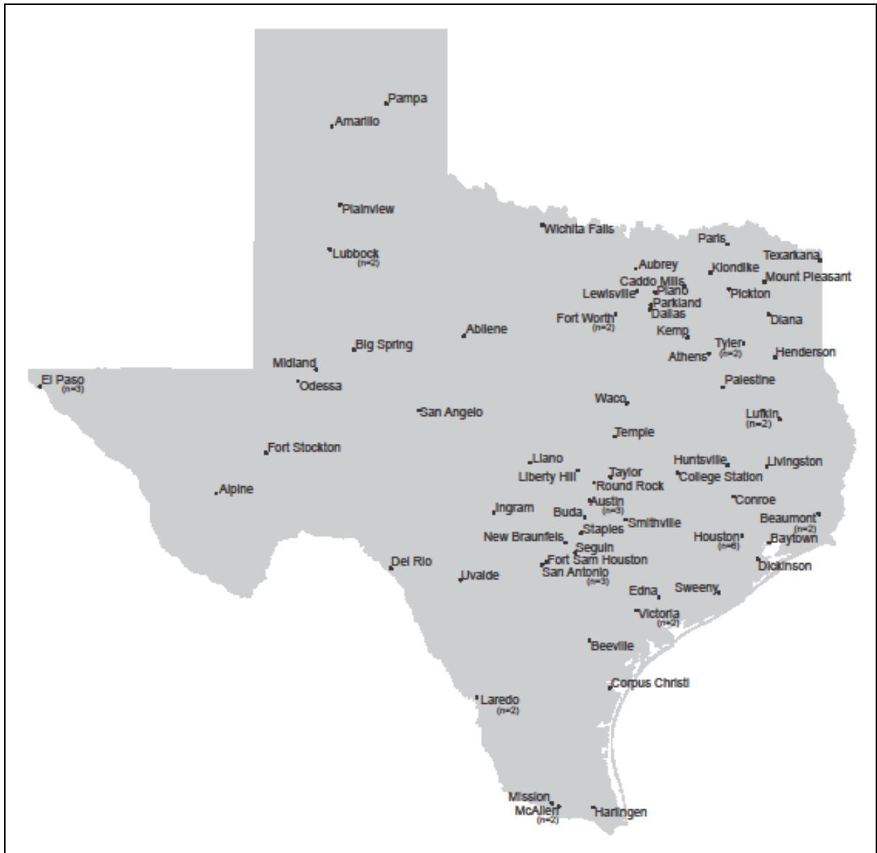
Figure 1. SANE coordinators in Texas