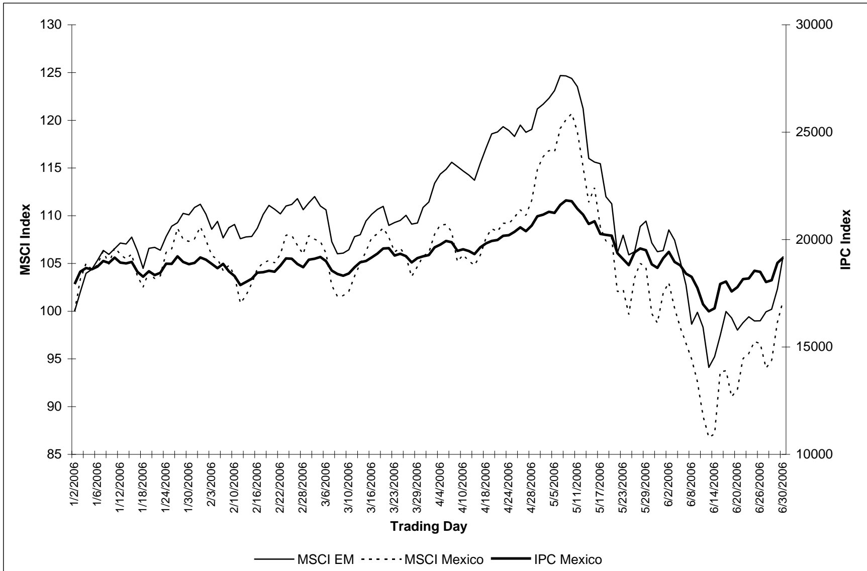
Figure 2: Mexico's Stock Market Index of Prices and Quotations (IPC) Compared to the Morgan Stanley Capital Index for Mexico (MSCI Mexico) and Emerging Market Nations (MSCI EM), January 2 – June 30, 2006