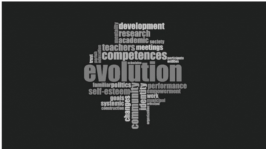
Figure 3 Word cloud of the focal group – model a.