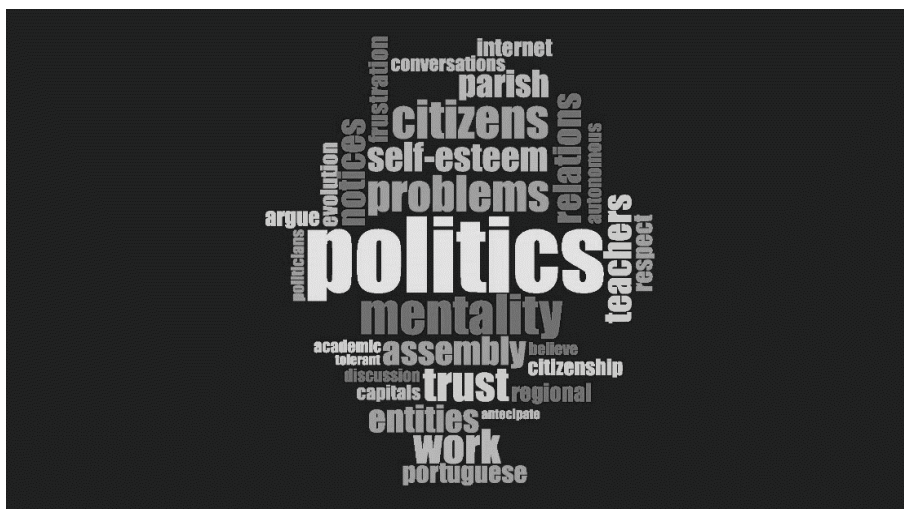
Figure 4 Word cloud of the focal group – model b.

opportunities; presentations, principal, discussion – threats, in model a); and b) the terms: self-esteem, communicate, respect – development of the person; politics, difference, confidence – development of individual action; politics, Assembly, Parish Council - social support; argue, upset, political – family; academic, conversations, frustration - school; implement, intention, negative – community.