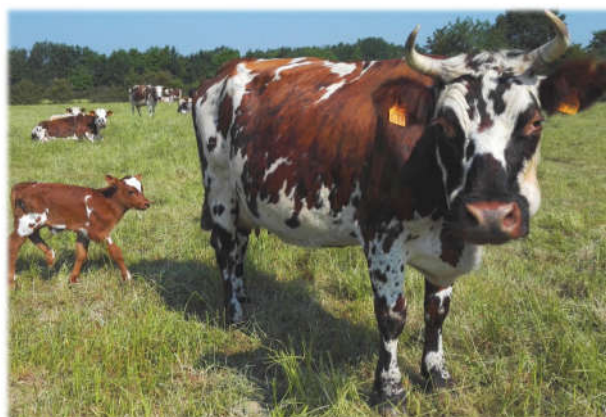
Group of cows and their calves in western France

Among interviewed farmers, 4 leave calves with their biological mother for a short period (15-45 days) before switching them to artificial feeding (no nurse cows). They follow this practice to ensure the health and welfare of the animals or decrease work demands. To avoid decreasing milk production, the calf is separated from its mother before weaning. It may then refuse to feed for at most one day before accepting another feeding system. These farmers consider the use of nurse cows too constraining and think that they do not have the area, buildings, or animals necessary to set up this practice.