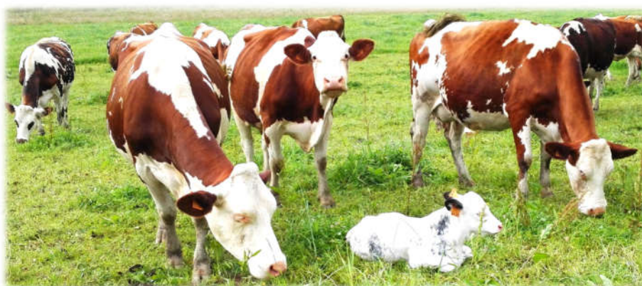
Calf and their mother grazing in eastern France

Improving animal welfare on farms is currently a major issue, in response to expectations of citizens and consumers. In organic farming, reflections are continuing on how to change livestock production practices to allow animals to express their natural behaviour most fully. Calf rearing in dairy systems is a focus of attention. At the moment, separating calves from their mothers remains the most common practice, but new techniques that favour the maternal bond are appearing. Understanding these practices better to identify conditions under which they can be adopted by more farmers was the goal of a survey conducted in spring 2018 of organic dairy farmers who rear calves with adult cows. This work has been made under the GrazyDaiSy project, funded by the European Union program Core organic.