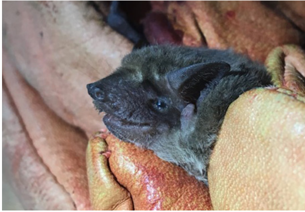
Figure 2. Adult male of Molossops temminckii from Sociedad Rural "Las Colonias", Esperanza City, Las Colonias department, Santa Fe province, Argentina.

Colombo, MD Gamboa, and LR Antoniazzi, January 2018, in a forest area bordered by cultivated fields with predominate of Eucalyptus sp. and Tipuana tipu .