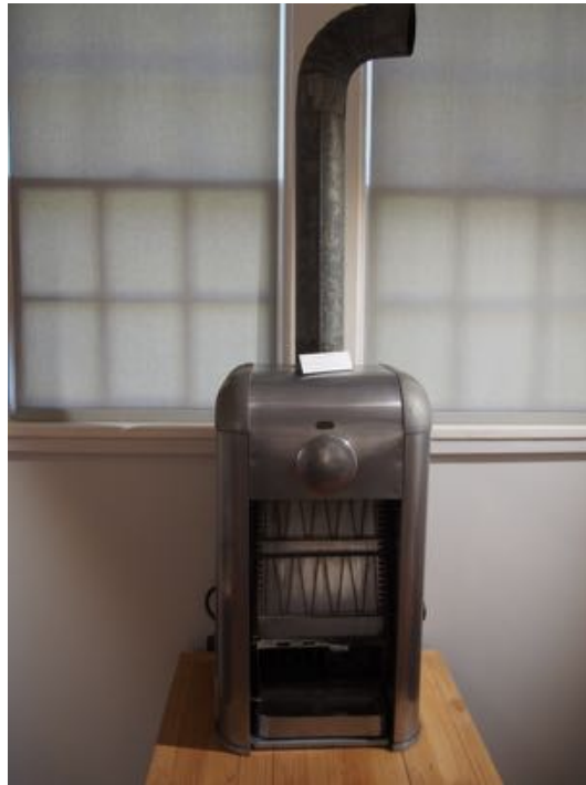
Industrial Toaster in the Patton Food Services Exhibit.

upon release while the stub was retained in the book for hospital records.