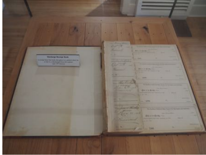
Discharge Receipt Book in the Patton Then and Now Exhibit.

The first exhibit, Patton Then and Now , in the museum provides information about the hospital's history and the history of mental health in California and offers the context for the rest of the museum. The artifacts chosen for this exhibit encompass the entire history of Patton from the discharge receipt book, dating from 1893, to artifacts from a time capsule that was opened in December 2014. The discharge receipt book is one of the oldest Patton artifacts that has survived. When patients were discharged from the hospital they would receive a discharge receipt from this book that would provide proof of their recovery and release from the hospital. This artifact reflects the custodial nature of late nineteenth century asylums. Patients during this time were almost always committed through court proceedings to the state hospitals and were usually released on probation or parole as though they were criminals rather than mentally ill and would often have to provide proof of their recovery and release. This artifact is very much like a large check ledger in that the receipt was handed to the patient