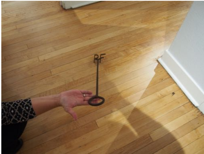
Branding Iron in the Self-Sustainment Exhibit.

toast per hour. This artifact became a centerpiece of the Patton Food Services exhibit because it is representative of the amount of work involved in feeding a large patient and staff population. It also allows visitors to understand what a physically large operation it was by being able to see just how large the machinery used in the kitchens was, and still is.