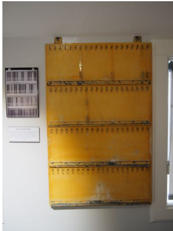
Toothbrush Holder in the Patient Life Exhibit.

cattle were then sent to the butcher shop and used in the kitchens to feed patients and staff. The branding iron shows that even a relatively small piece of an exhibit can communicate a theme thoroughly.