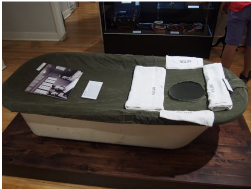
Hydrotherapy Tub in the Patient Treatment Exhibit.

unit on the Patton campus, it has put into perspective the difficulties that come with sharing personal space with such a large group of people. This particular toothbrush holder holds up to 80 toothbrushes. It kept the toothbrushes organized in horizontal rows hanging from small nails in the board. With such large groups of patients averaging eighty per unit even the mundane activity of brushing one's teeth becomes a struggle. The object evokes in most visitors the image of patients fighting over the top spots on the holder in order to keep their toothbrushes out of the line of drippings from other toothbrushes above. This artifact is one that brings the patient's story to life and allows patrons to understand the complexities of patients' daily lives while at Patton.