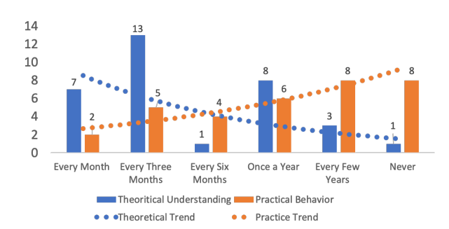
Figure 1: Adult's theoretical understanding versus their actual practices of changing their passwords.

"My Name Is My Password:" Understanding Children's Authentication Practices