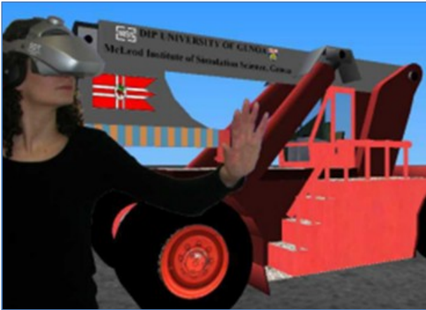
Figure 3: Head Mounted Display in Virtual Prototyping

During the last years, also other solutions have been experimented by Simulation Team Partners for supporting AR and VR in multiple applications from Virtual Prototyping of Cranes to Electrical Boards and Marine Solutions (Bruzzone et al 2010).