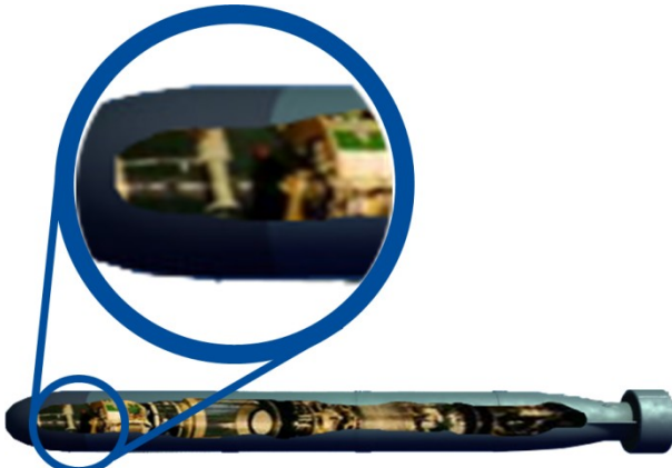
Figure 1: Concept of Virtual Mock Up for an Educational and Training Aid for AUV Service