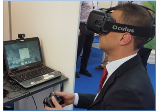
Figure 4: VR based on Oculus and Game devices

Indeed the Gas Container business sector involves big enterprises and include management and logistics of several hundred thousand containers of different type and size. This issue is even more crucial in Healthcare Sector. Given the average cost of a single unit, the container stock represent a capital for the companies; furthermore the containers, in particular gas cylinders, are easily lost or stolen and require to be controlled over wide regional distribution. Currently, it results pretty interesting from major companies active in providing these service to investigate new solutions and architectures to track cylinder locations in the gas container business. This aims to reducing cylinder losses, improving containers managements and stock controls. In addition, the producers of medical ventilators result interested in developing new capabilities to remotely assist patients increasing direct supervision and reducing the manning required to maintain the apparatus.