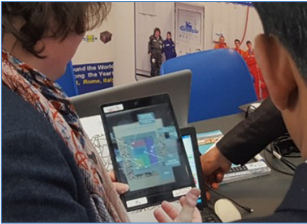
Figure 5: Solution based on tabled and AR