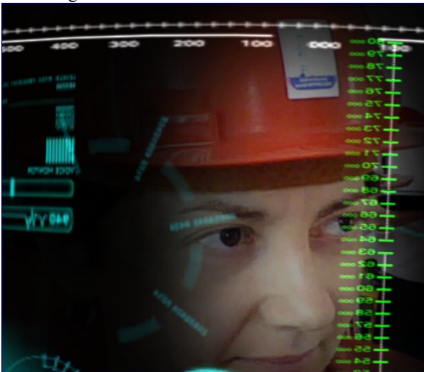
Figure 6: AR solution based on web application