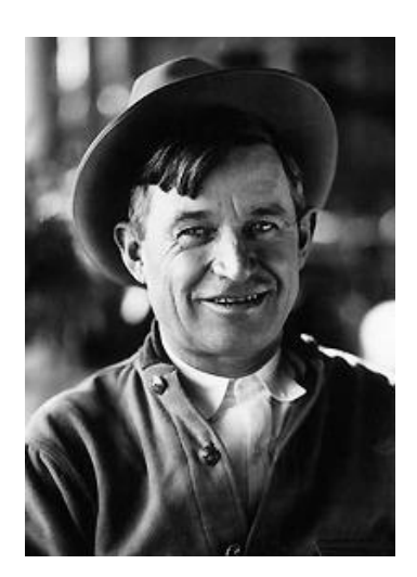
Image 1. Will Rodger has an authorship of so well-known in biology phenomenon.

the calculation that mean value of elements of X will rise to 3, and mean value of elements of Y - to 7,5.