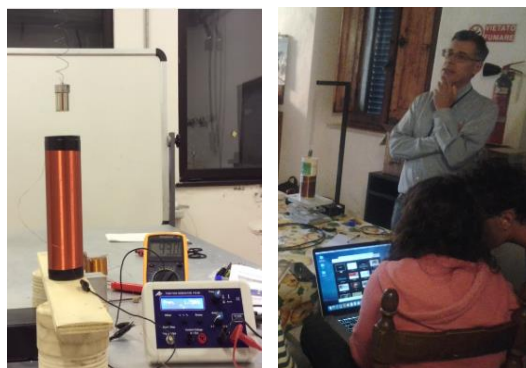
Figure 4. The magnet hanging from a spring and the solenoid in laboratory (on the left) and during the physics summer school for students (on the right).

The reaction between calcium carbonate (marble \text{Ca}_2\text{CO}_3 ) and hydrochloric acid (HCl) depends on the contact surface between a solid and the surrounding liquid. The products of this reaction are water, calcium chloride and a gas, carbon dioxide. The missing mass vs. time allowed to determine the speed of the reaction (see Figure 5). An interdisciplinary learning path focused on this laboratory was tested previously in a vocational school with good results. A group discussed the educational aspects and the effectiveness of the laboratory.