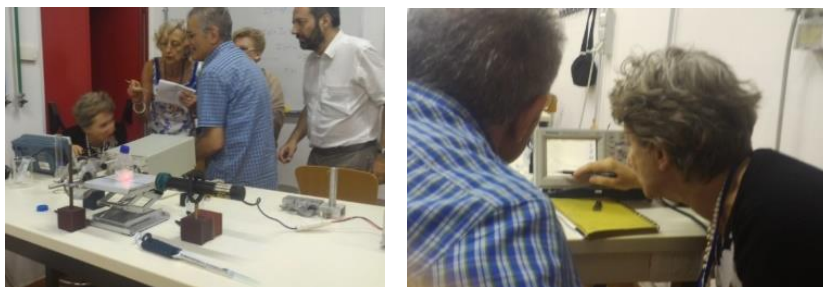
Figure 6. The experimental set-up for the reaction between sodium thiosulphate and hydrochloric acid (on the left) and teachers that analyse the data on the oscilloscope in order to determine the characteristic time of the reaction.