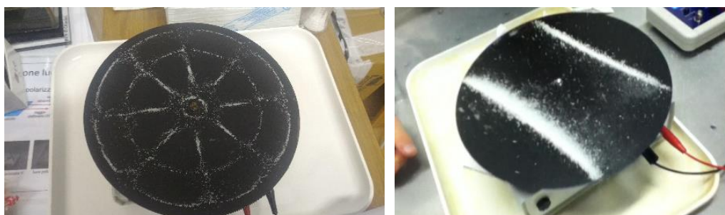
Figure 3. Two different Chladni figures are shown. The visualisation of the nodal patterns is obtained by putting some salt on a metal plate that is forced to oscillate with a fixed frequency. The resonance is easily recognizable by observing the movement of the salt which quickly concentrates in the nodal lines when the frequency corresponds to a normal mode of the vibrating plate.

Resonance is a fascinating phenomenon that allows the transformation of energy in a different physical system with negligible thermal dissipation. A learning path on sound was presented for understanding the relevance of resonance in the production and detection of sounds in our body [15]. A teachers' group explored resonance qualitatively by searching the resonant frequencies through the Chladni figures (nodal patterns) in a vibrating metal plate forced by an oscillating force (Figure 3).