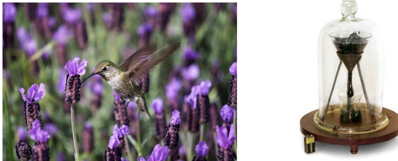
Figure 1. On the left, the flight of a hummingbird among flowers. The wing beating of a hummingbird is a very short time that requires special techniques like particle image velocimetry [10]. The pitch drop experiment is shown on the right. In this case, a time-lapse technique can be used for showing the slow dripping [11].

Some examples of the tasks proposed to participants were: