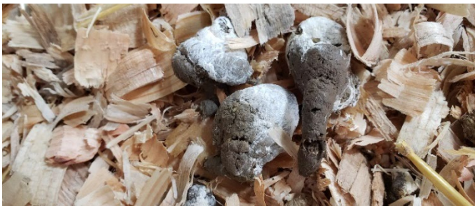
Figure 2. Chicken manure on pine shavings. Note that urine (white substance) is part of bird manure and contributes to high salinity.

Raw manure also poses health risks for crops grown for human consumption. Raw manure can harbor unsafe pathogens such as E. coli , Listeria and Salmonella . The USDA’s National Organic Program’s standard is to apply raw manure at least 120 days before the harvest of crops that come in contact with the soil (carrots, onions, potatoes) and 90 days for crops that do not contact the soil (strawberries, tomatoes, peppers). It is critical for growers to vigilantly follow food-safety practices and carefully plan application timing to reduce the risk of crop contamination. Balancing soil and crop nutrient requirements, building organic matter, meeting manure disposal needs, monitoring soil pH and salinity levels, and being mindful of food safety is key to sustainable land management with manure.