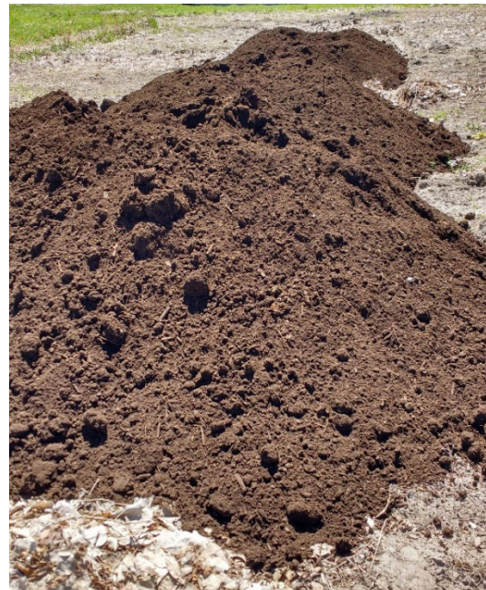
Figure 5. Compost ready to spread and incorporate into a garden.

As a general rule of thumb, about 1 inch of compost can be sustainably added to most Utah soils each year. More may be added depending on your compost source and soil test. Reduce compost use, particularly manure-derived compost, if your soil test shows elevated levels of P, K, and salinity. Here, we provide an estimate of Utah compost characteristics based on analysis of compost samples sent to the Utah State University Analytical Laboratory from 2005 – 2019. Table 2 (next page) lists the expected N, P, and K contents, pH, salinity, moisture content, and C:N ratio.