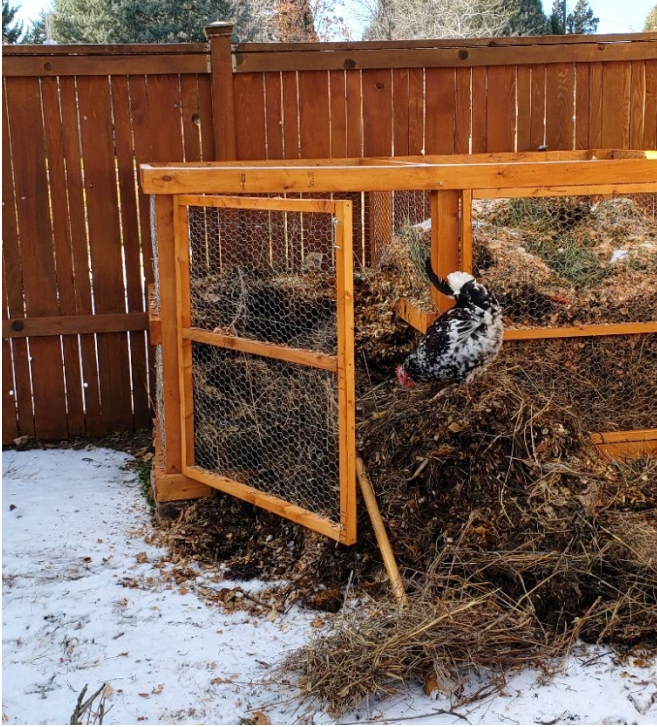
Figure 4. Backyard compost pile with manure and plant components.

meal, fish emulsion, etc.); rotate with legume crops (beans, peas); or plant leguminous cover crops (birdsfoot trefoil, hairy vetch, medics). The worksheet at the end of this fact sheet (page 6) is a step-by-step guide that helps determine how much manure can be sustainably added to your soil and whether additional N will be needed. This fact sheet has a companion fillable workbook that will automatically calculate sustainable rates for your soil.