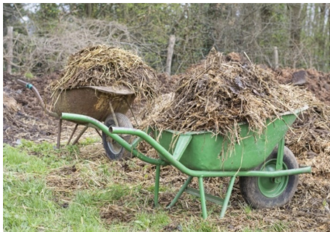
Figure 1. Manure mixed with high percentage of straw bedding material.

to the soil. Solid and semi-solid manures (<75% water content) and composts contain more organic matter and are generally more effective soil builders than liquid manures and slurries (>75% water content). Manures are also readily composted because they have relatively low carbon to nitrogen (C:N) ratios that allow for quick composting. This fact sheet will focus on solid manures and composts that are most common in urban, garden, and micro farm settings.