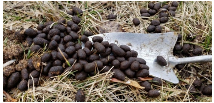
Figure 3. Collecting manure (deer) for manure testing.

Because manure varies widely and changes with the many factors listed, manure or compost should be tested for the best accuracy. USU’s Analytical Laboratory tests manure and compost and provides information on proper sample collection and test pricing. To provide an estimate of manure content in Utah, we analyzed all of the manure samples sent to