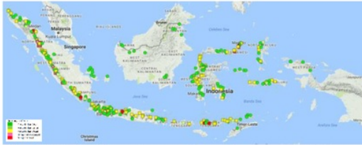
Fig. 1. Distribution potency geothermal resource in Indonesia [1]

addition, the community is also concerned that the exploitation around Mount Talang will have an impact on the beauty of the natural surroundings. Such is the case in Mount Lawu and Bedugul where cultural aspects are part of the community's rejection.