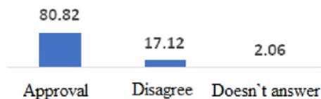
Fig. 3. Perception of people for development geothermal electric power plan in Mount Ungaran

Disagreements with the construction plans of the Mount Ungaran geothermal power plant also arose from NGO organizations caused by concerns about environmental damage, threat on cultural heritage and potential loss of livelihoods as shown in Table 2 and Table 3.