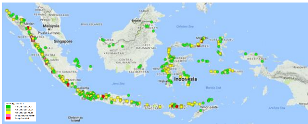
Fig. 1. Distribution potency gothermal resource in Indonesia [1]

addition, the community is also concerned that the exploitation around Mount Talang will have an impact on the beauty of the natural surroundings. Such is the case in Mount Lawu and Bedugul where cultural aspects are part of the community's rejection.