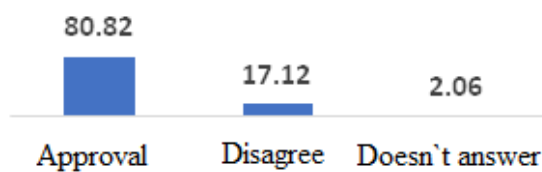
Fig. 3. Perception of people for development geothermal electric power plan in Mount Ungaran

Disagreements with the construction plans of the Mount Ungaran geothermal power plant also arose from NGO organizations caused by concerns about environmental damage, threat on cultural heritage and potential loss of livelihoods as shown in Table 2 and Table 3.