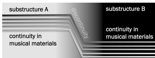
Figure 1. The emergence of substructures through weakening of the continuity of musical materials

The use of discontinuity to mark structural divisions is a common musical practice in musical composition. In Sonata Form, for example, continuity is often broken by disjunctions such as a quickening of harmonic rhythm, a cadence in a new key, and a short silence, to mark the boundary between substructures. However, a high level of homogeneity and contingency between the substructures is usually maintained through relative continuity in other parameters such as meter, tempo and proximity of the modulation.