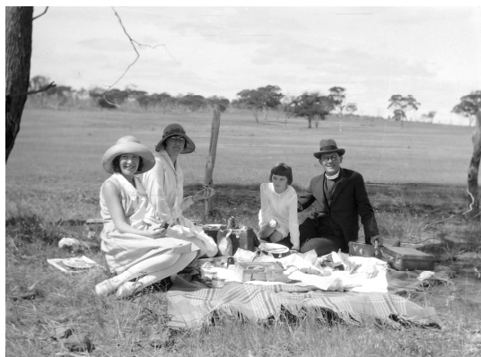
The author as a young girl with her family.

I was going to write this talk about the creative process from the inside, so I was going to do daily things. I was going to have a daily practice of writing in my journal. I did it for about three days and then completely forgot—well, not really forgot... There was more than three days' writing. Parts of it are reproduced below, because I believe that every bit of my experience contributes to my music. The experiences, inner and outer, that are written there are those that contributed to my music within the allotted time.