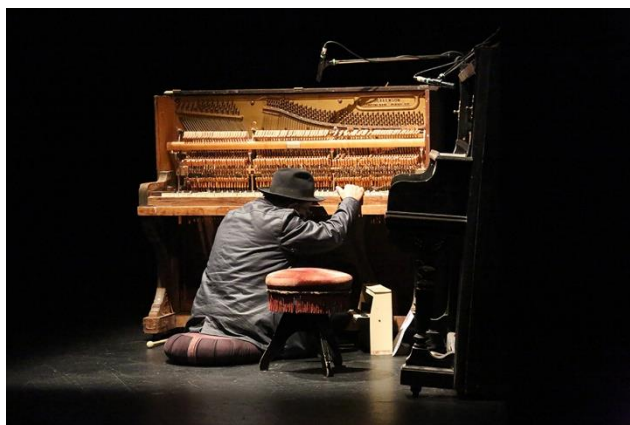
Fig. 2: Ross Bolleter performing Quarry Music ; PICA (26 Oct 2017); photo Bohdan Warchomij; image courtesy of Tura New Music.

Ross Bolleter is a West Australian legend who plays “ruined” or severely damaged pianos. At the Perth Institute of Contemporary Art, Bolleter gave what was promoted as his “final public performance,” although in his artist talk shortly before he suggested some ambiguity regarding what constitutes either a “performance” or a “public” one. 8 It was perhaps not surprising then that his performance of Quarry Music reflected a similar ambivalence.