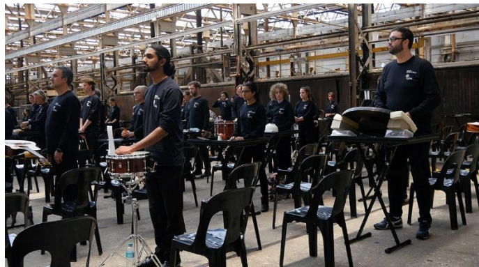
Fig. 5: Speak Percussion and others perform Pisaro’s A Wave and Waves ; Midland Railway Workshops

The festival concluded with the Speak Percussion ensemble leading ninety-six local lay-performers in Michael Pisaro’s suite for quiet percussion, A Wave and Waves (2008). Pisaro has been a composer and instructor at Calarts and the Northwestern University Integrated Arts Program, where he has pioneered new and alternative notational and scoring systems. 23 A Wave and Waves was originally produced as a multi-track recording for Greg Stuart, who radically reconceived his practice after an illness left him only able to perform small movements and quiet, subtle noises. This did not however cause Pisaro to reject his communitarian approach to music. He previously proclaimed that, “What writing music comes down to, in the end, is care. We create situations. We care about them and take care of them. And we care for the people involved.” 24 Though A Wave and Waves is complex in scale and duration, it is a disarmingly simple score, which explicitly calls for individual interpretation.