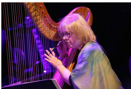
Fig. 3: Anne LeBaron performs “Dog-Gone Cat Act,” Subiaco Arts Centre (27 Oct 2017); photo Bohdan Warchomij; image courtesy of Tura New Music.

A festival highlight was the retrospective of American composer Anne LeBaron's compositions for harp and other instruments. 16 Guy Rickards notes that LeBaron: