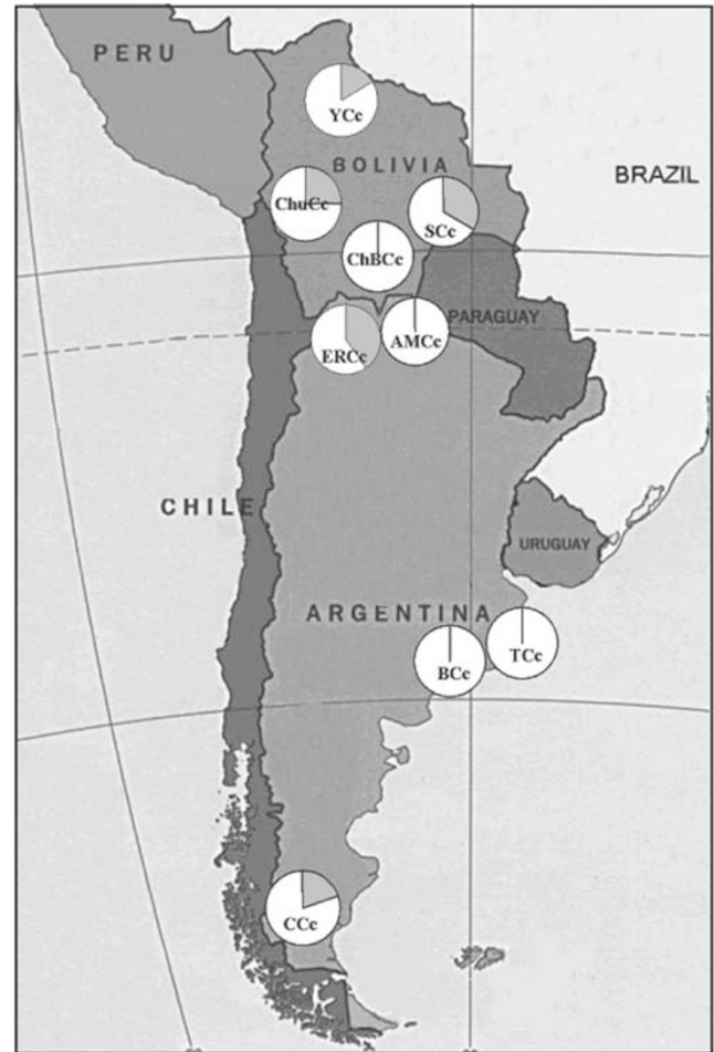
Figure 1 Map showing the populations of Argentinean and Bolivian cattle examined. The proportion of African haplotypes in each sample is illustrated by the filled sectors of the pie charts. YCc: Yacumeño breed, ChuCc: Chusco breed, SCc: Saavedreño breed, ChCc: Bolivian Chaqueño, ERCc: El Remate, AMCc: Arroyo del Medio, BCc: Balcarce, TCc: Tandileufú, CCc: Calafate.

Total DNA was extracted from blood samples using the DNAzol purification kit (Gibco Life Technologies, Rockville, MD, USA) following the manufacturer's instructions. Animals were preselected before sequencing by PCR-SSCP analysis to include a range of genetically distinct individuals. The PCR primers used were SSCPG3.F and SSCPG4.R (Eledath and Hines, 1996), which amplify a 489-base-pair fragment of the D-loop. The 50 µl reaction mix contained approximately 100 ng of total DNA, 0.5 µM of each primer, 0.1 mM of dNTPs and 2 U of Taq polymerase (Gibco Life Technologies, Rockville, MD, USA) in 20 mM Tris-HCl (pH 8.4), 50 mM KCl and 2 mM MgCl 2 , under mineral oil. The PCR consisted of a first denaturation step at 94°C for 2 min followed by 30 cycles of 45 s at 94°C, 1 min at 50°C and 1 min at 72°C, with an elongation step of 5 min at 72°C in the last cycle. For the SSCP analysis, 15 µl microliters of each PCR product was added to 40 µl of dye LIS (10% sucrose, 0.01% bromophenol blue and 0.01% xylene cyanol FF).