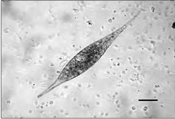
Fig. 6. Absonifibula bychowskyi Lawler et Overstreet, 1976; Micrograph of in vivo extrauterine egg; Scale-bar = 0.06 mm