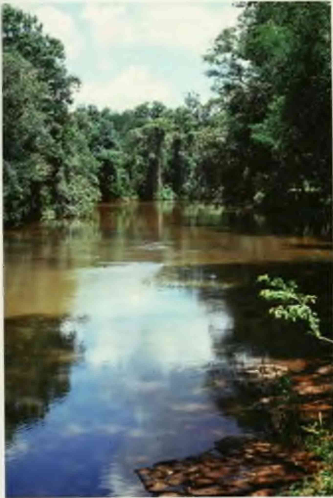
FIG. 4. Habitat of Crenicichla tesay sp. n., arroyo Verde, type locality.