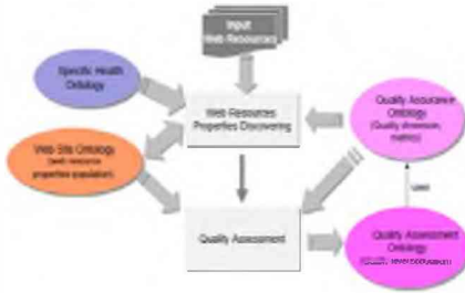
Fig. 3. Salus Quality Assessment