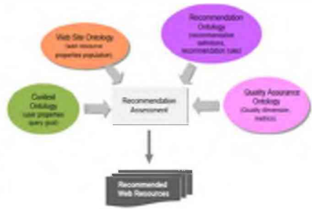
Fig. 4. Salus Recommendation Assessment