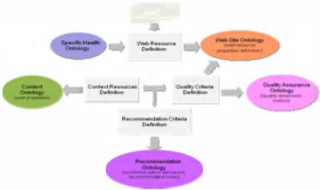
Fig. 2. Salus recommender start-up

will be identified in the recommendation criteria definition. Mainly, they are: the user properties and the query resources . The user properties are those that were already relieved at the recommendation criteria definition task and will be populated at the moment of registering a user at the recommender system: For instance, if at the recommendation criteria definition was specified the user property belongs , when she is registered to the system, this property is instanciated between Paul and 12-20 range . The query resources refers to query attributes like query goal .