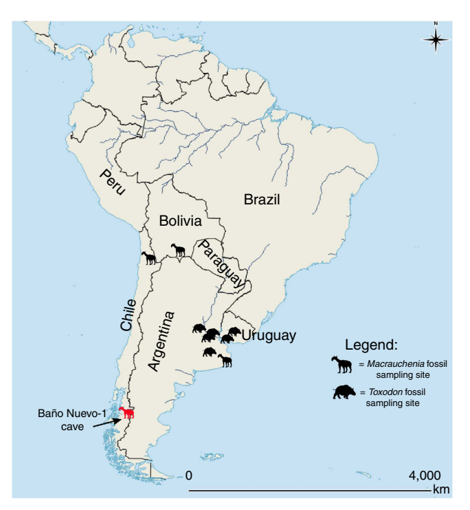
Figure 1 | Map of sites yielding specimens of Toxodon and Macrauchenia. MAC002 Macrauchenia , the sample from which mitogenomic data were successfully collected, came from a metapodial recovered at the locality Baño Nuevo-1 Cave (in red). For locality context, see Supplementary Note 1 and Supplementary Fig. 8. Map generated using QGIS 2.8 (QGIS Development Team, 2016. QGIS Geographic Information System. Open Source Geospatial Foundation Project. http://www.qgis.org/).

Validation of the iterative mapping approach using MITObim. The lack of a suitable reference mitochondrial sequence necessitated an iterative mapping approach. We used the iterative mapping software package MITObim<sup>17</sup>, which has been used successfully for mitochondrial reconstructions using modern DNA. Reference sequences for the following four species