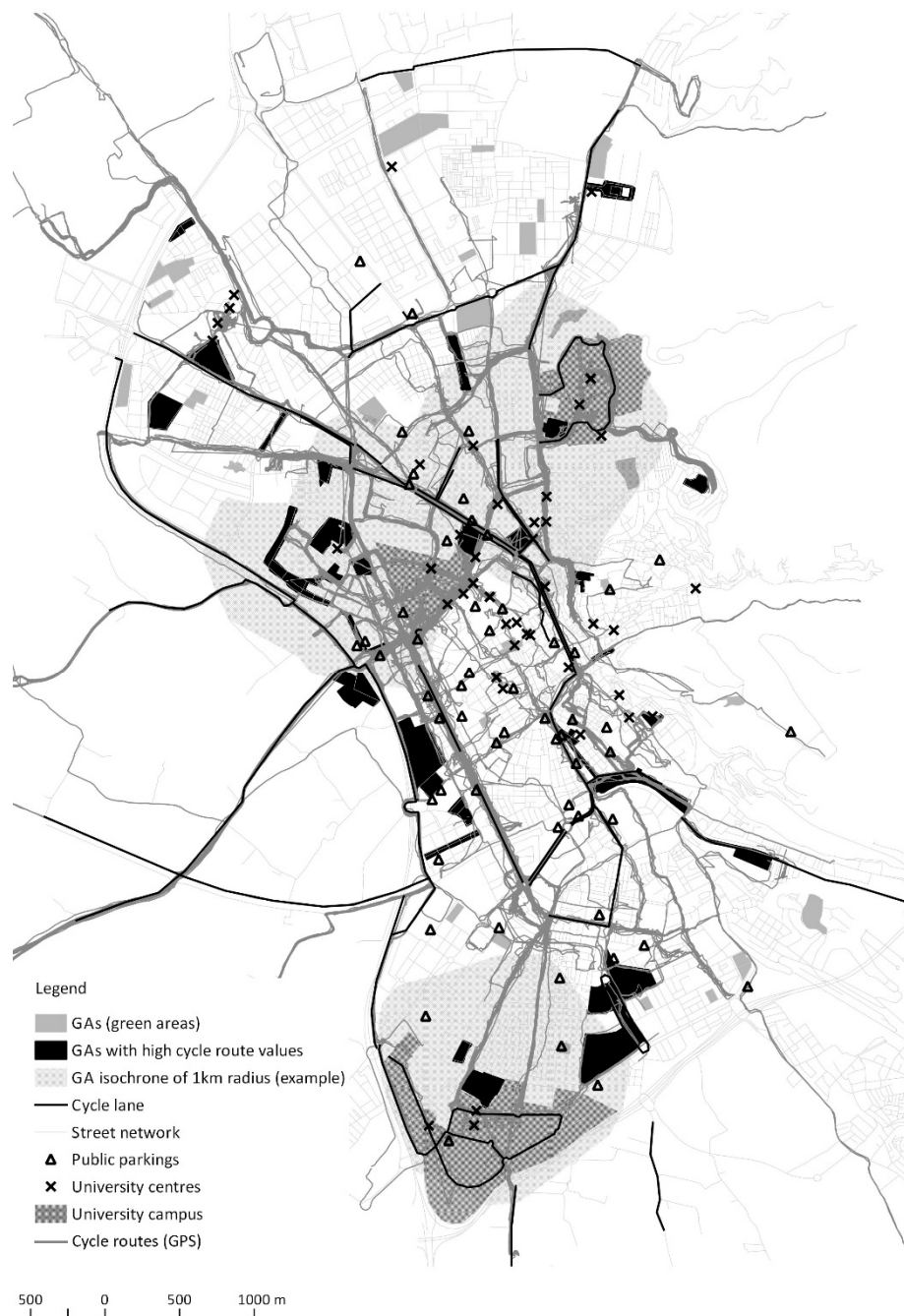
Figure 3. Spatial identification of the significant variables.