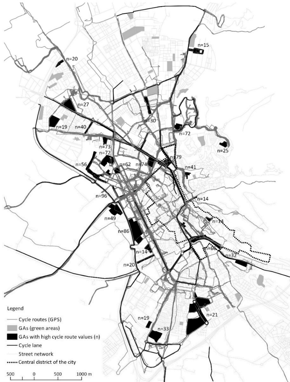
Figure 2. Cycling routes and green areas.

The probabilities describing possible results from the dependent variable were modelled using a logistic function based on the explanatory variables. Table 2 shows the descriptive statistics for the calculation variables. The mean of the source data (i.e., median: a value representing the central position of the source data set) was chosen as the reference value for the cut-off points among dichotomous values (1–0), except for (a) variable n° 13. Bicycle racks, where: 1 = bicycle racks within the corresponding buffer catchment area, 0 = no bicycle racks; and (b) for variable n° 7. Altitude, where: 1 = altitude within 663–713 m (Percentiles 25 and 75), and 0 = the remaining values. The latter classification was made on the assumption that cyclists prefer to travel at medium altitudes (interval P25–P75), and not at extreme ones (intervals min.–P25 and P75–max.), which implies a higher physical cost.