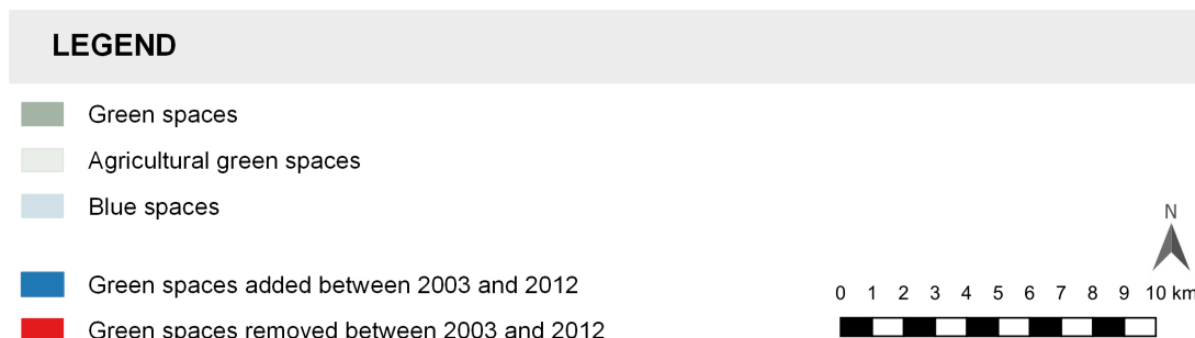
Figure 2 Changes in (A) green, (B) green and blue, (C) green and agricultural, and (D) green, blue and agricultural green spaces in the Eindhoven city region between 2003 and 2012.