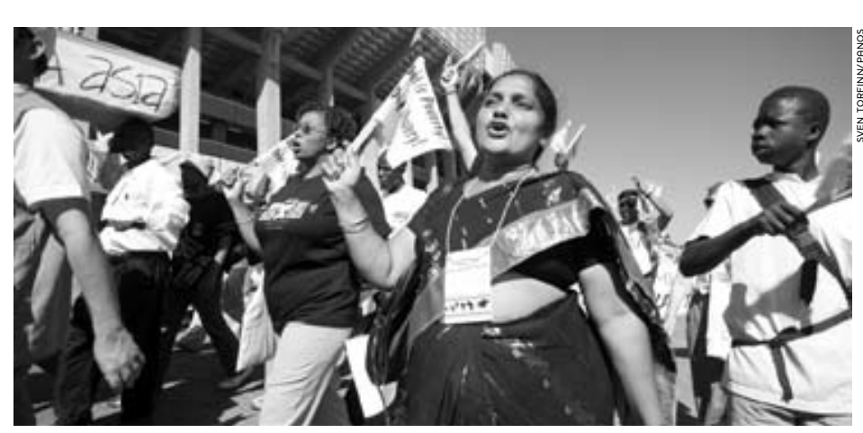
Anti-poverty campaigners unite to march for debt relief at the 2007 World Social Forum

Certainly not all cases of civil society campaigning are as successful as these, as a related study by Robinson and Friedman finds<sup>1</sup>. But these eight cases