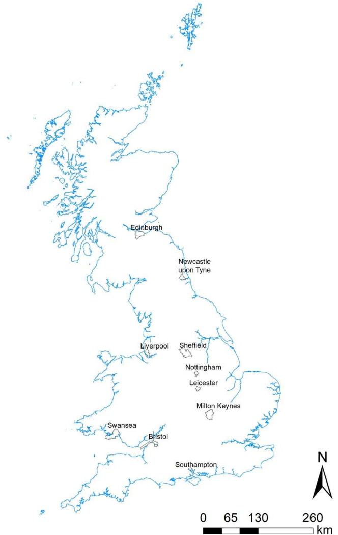
FIGURE 1 Urban study areas (administrative boundaries) in the United Kingdom

Other urban areas such as Swansea included rural lands that were outside of urban built-up areas but within the city's administrative jurisdiction, and thus may be suitable for biofuel production according to the criteria used here. In the case of Swansea, this produced high absolute and proportional values of greenspace land deemed suitable for biofuel production (Figure 2b; 8% of total administrative area), although uncertainties in the suitability of uplands for biofuel production may lead these figures to overestimate suitable land area. By contrast, in other locations, the impact of these extra-urban lands was tempered by conflicting exclusion criteria; much of the extra-urban land in Milton Keynes is ALC grade 1–3 and was thus excluded to avoid conflict with high-grade food production lands (Figure S6; 3% of administrative area deemed suitable), and much of Sheffield's extra-urban land is part of the Peak District National Park and was thus excluded due to the presence of protected and sensitive habitats (Figure S8; 2% of administrative area deemed suitable).