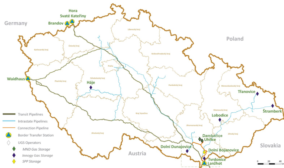
Figure 1. The scheme of distribution of UGS in the Czech Republic [8]

A total volume of gas in UGS (reservoir layers – storage horizons) can be divided into two basic parts – active and passive. The passive part is referred to as a basic filling, i.e. cushion gas. This part consists of gas that is permanently located inside an underground storage both during the withdrawal and after it [9,10,11]. The active part is the operational capacity of gas itself in UGS (so-called storage capacity), which is operatively injected and consequently withdrawn from the reservoir according to the demand of customers and for trade purposes. Total storage capacity, the size of the active and basic filling (cushion gas) belong to the basic parameters of UGS. Total storage capacity directly depends on the size of the pore volume of the reservoir layers. If the storage object is the original source of hydrocarbons, the total storage capacity is related to its initial volume.