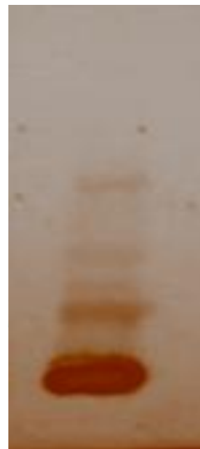
Figure 1: TLC profile of extract of Mesua ferrea

The analytical standardization was performed using chromatographic and spectral techniques. Thin layer chromatography was performed as chromatographic method to separate out important phytoconstituents from herbal extract. The combination of solvents; Ethyl acetate: methanol: formic acid (7: 2.5: 0.5 v/v/v) was used as mobile phase and separated chromatogram were observed at R_f value above 0.25 as mentioned in Figure 1 .