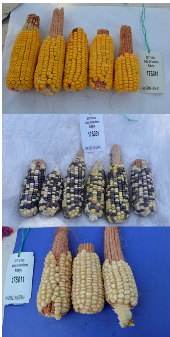
Fig. 1 -Yellow grained (top), misclassified seed material (center) and white grained (bottom) D_0 lines

A reason for using in vivo maternal haploid technique in maize breeding is that this method is simple and fast for producing DHs. The seed morphological color pigment marker (R1-nj) facilitates rapid selection of haploid seeds after hybridization. However, as in our study, this morphological marker was ambiguous in some genotypes. Since our source material was composed of both yellow and white grained maize, the purple color marker was often less easily detected in the endosperm. However, in some cases, the purple color in embryo was not clear, but when the embryo