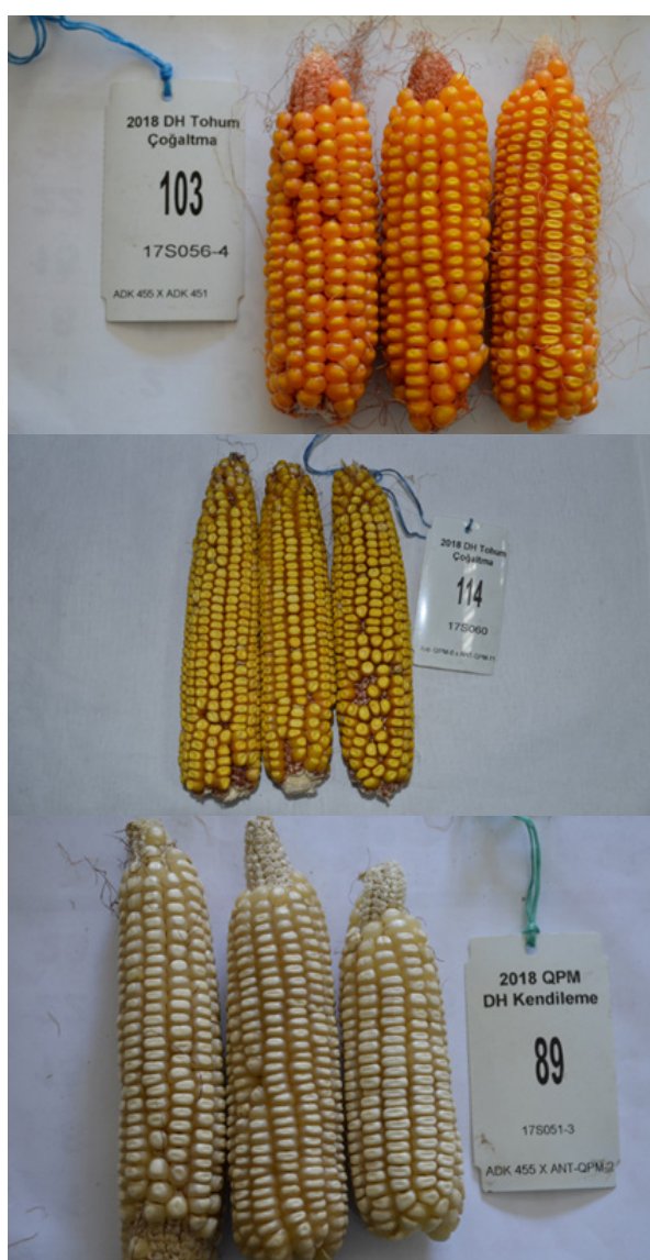
Fig. 3 -Images of some developed D_1 lines with different types, colors and sizes

*: The labels on the columns are given to emphasize the lysine and methionine status of some specific lines