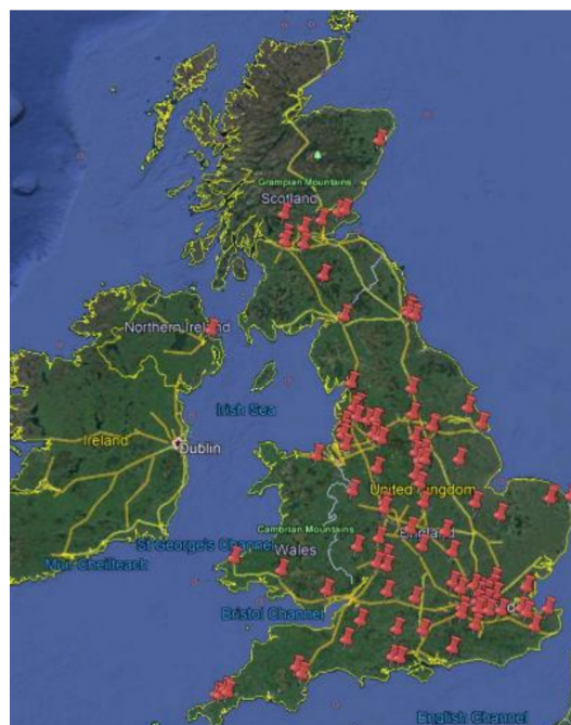
Figure 1 Geographical location of survey respondents (n=154). Each pin represents a single postcode (first three or four digits).

One hundred and fifty-six people completed the two mandatory questions (confirming that they were an occupational or physiotherapist and that they were currently clinically working with stroke survivors at any stage of their recovery in the UK). Two respondents'