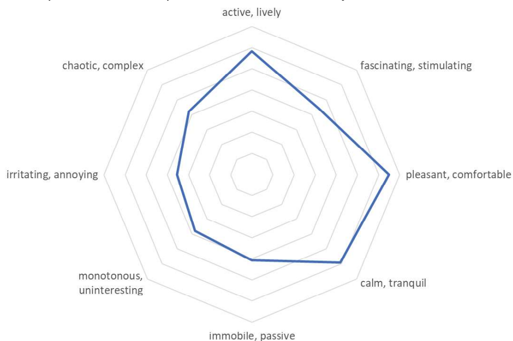
Figure 1 – Spider graph of kitchen soundscape evaluation.

The soundscape evaluation from the broad study (question (3)) is treated as a continuous scale and responses are averaged. This gives an average score on each of the eight dimensions that is shown in Fig. 1. Standard deviations over the population of respondents are similar for each dimension and amount to slightly under one unit. On average the kitchen soundscape at home is evaluated as pleasant and comfortable, quite calm and tranquil, but also active and lively.