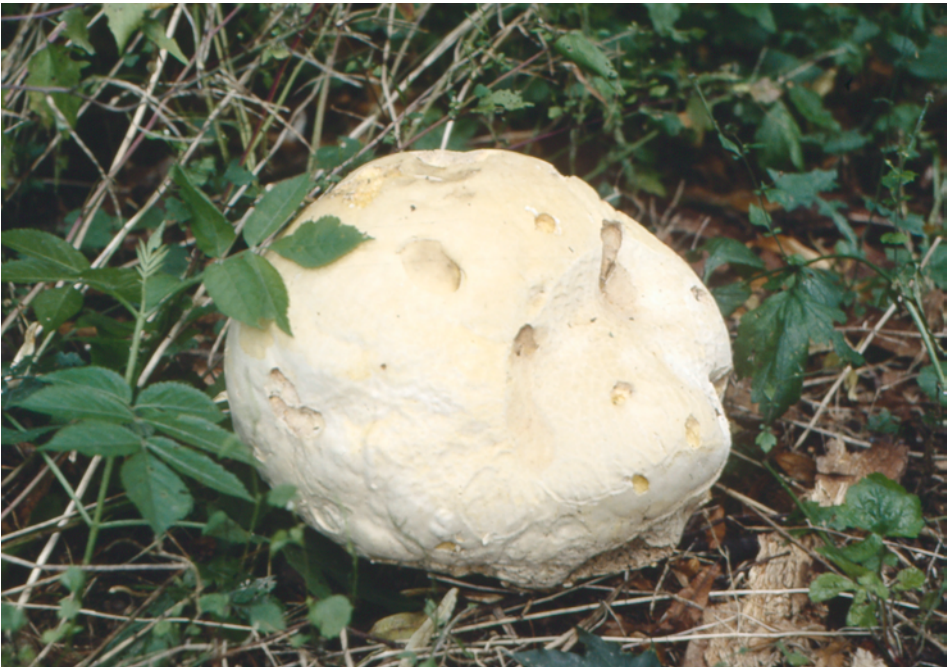
Fig. 5. Langermannia gigantea .