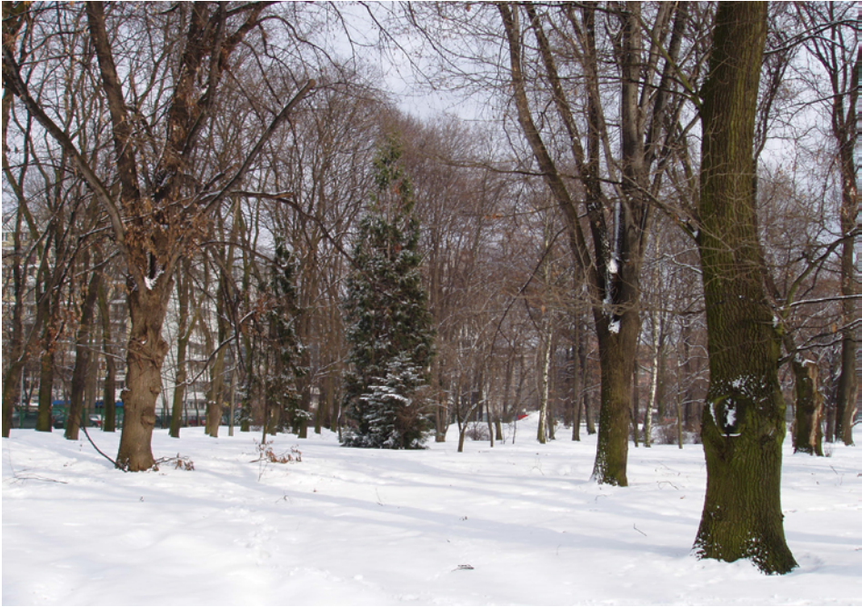
Fig. 2. Snow-covered Dendrological Park. Phot. A. Szczepkowski.