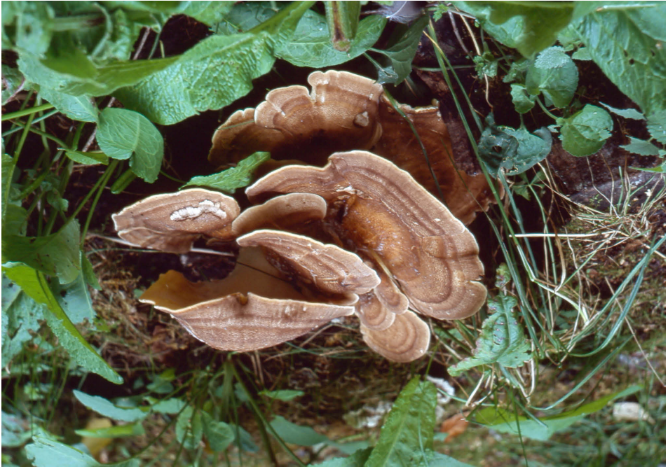
Fig. 6. Meripilus giganteus .