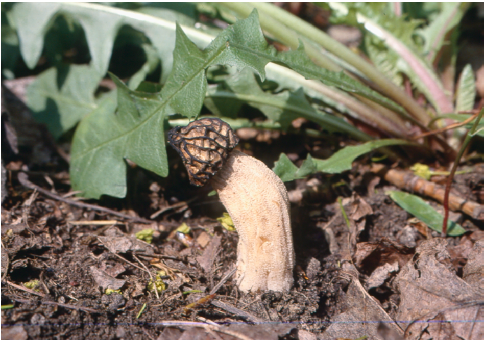
Fig. 7. Morchella semilibera .