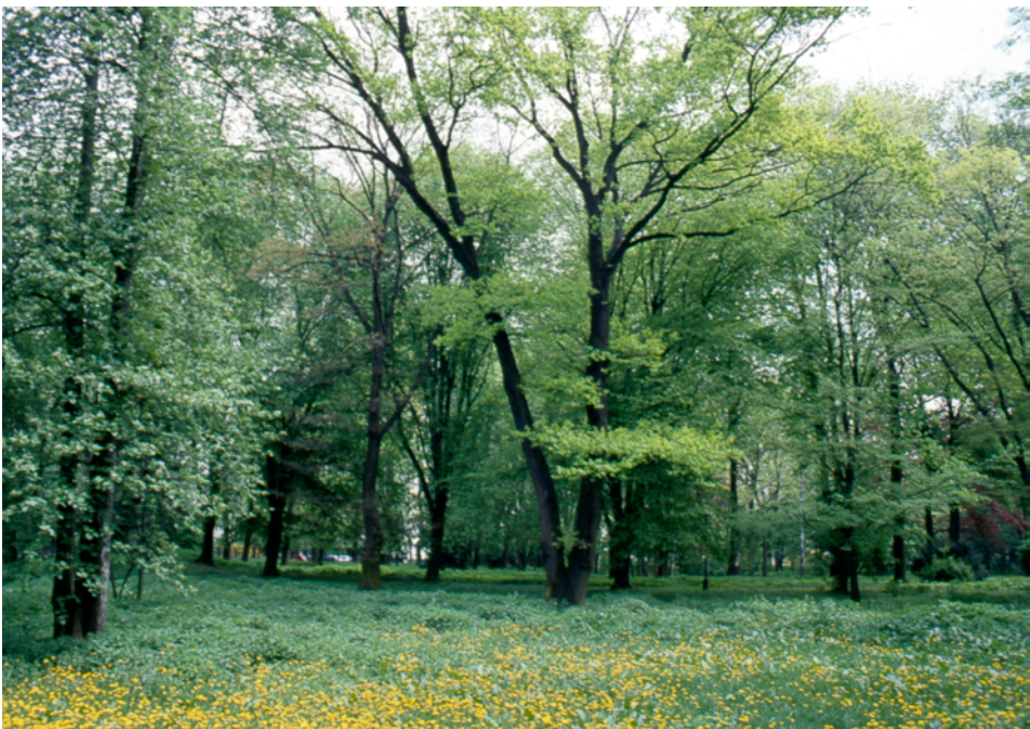
Fig. 3. The largest glade, formed after the removal of dying trees in the Dendrological Park, and its surrounding area.