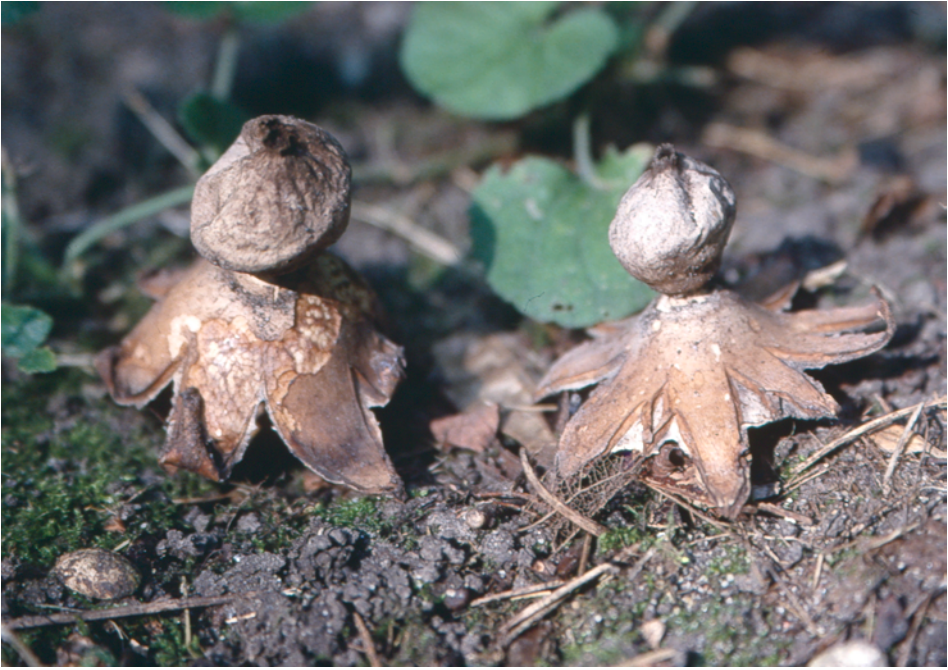
Fig. 4. Geastrum coronatum .