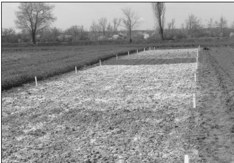
Fig. 1. Experimental field from Moara Domnească – Ilfov (2013)

Rates for soil improving were determined according to the neutralize power of amendment and soil hydrolytic acidity.