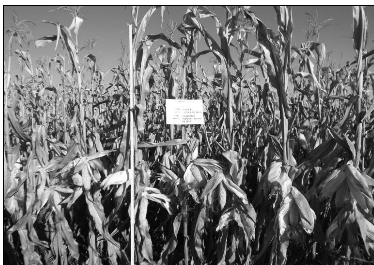
Fig. 4. Experience with maize of experimental field from Moara Domneasca (2013)

Maize production was positively influenced by the application of different rates of slag, in the control variant yield was 72.15 q/ha and increased to 79.66 q/ha in variant V 5 (5 t/ha). Production growth was 4.13 q/ha to V 2 (1 t/ha), 2.83 q/ha to V 3 , 2.1 q/ha to V 4 and 1.50 q/ha to V 5 (5 t/ha).