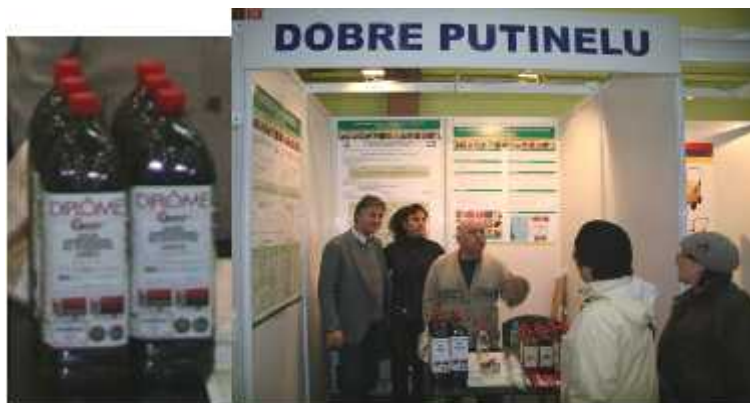
Fig. 4 -Comercial product presented at Fair INDAGRA Bucharest, 2015

The product is under certification by the Ministry of Agriculture and Rural Development, after being presented at numerous national and international salons invention, which was awarded with diplomas and medals (Fig. 4 and 5).