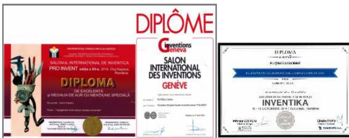
Fig. 5 -Diplom with Medals