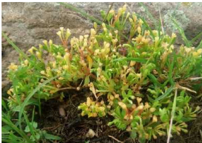
Fig. 4. Montia fontana L. subsp. chondrosperma (Fenzl) Walters – habit

( M. fontana L. var. chondrosperma Fenzl 1843, in Ledeb., Fl. Ross. 2: 152; M. verna Neck. 1766, Delic. Fl. Gallo-Belg. 1: 70, nom. illeg., quoad descr.; M. minor C.C. Gmel. 1805, Fl. Bad. 1: 301, nom. illeg., quoad descr.).