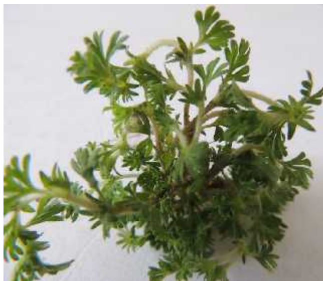
Fig.1. Aphanes australis Rydb. – habit

20: 458 (1984); Ciocârlan 2000, Fl. Il. Rom., Pterid., Spermat., ed. 2: 320) (Rosaceae). – Fig. 1.