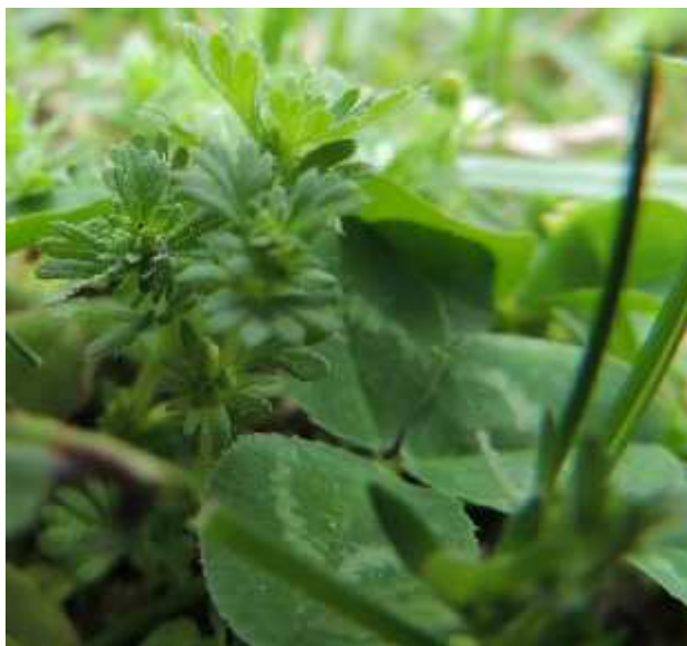
Fig. 3. Aphanes australis with Trifolium repens in the meadow on Sc rița hill, Novaci

On Sc rița hill (Novaci) Aphanes australis (Fig. 3) was identified on the meadow of Festuca rubrae - Agrostietum capillaris or in empty area of the meadow, together with Medicago lupulina , Trifolium repens , Plantago lanceolata , Cerastium glomeratum , Rumex acetosella , Eryngium campestre , Hieracium pilosella , Veronica arvensis , V. officinalis , Hypochaeris radicata , Arenaria serpyllifolia , Leucanthemum vulgare , Potentilla reptans , Scleranthus annuus subsp. polycarpus , Lotus corniculatus , Achillea millefolium , Filago arvensis , Leontodon autumnalis etc. It can also be seen in area dug by wild boars, with variable humidity together with Montia fontana subsp. chondrosperma .