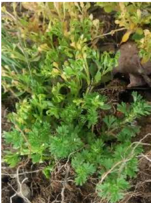
Fig. 6. Montia fontana L. subsp. chondrosperma (Fenzl) Walters alongside Aphanes australis Rydb. on a surface dug by wild boars – M gura hill, Cern dia

On the meadow near Racovița, on a humid soil, the species Montia fontana subsp. chondrosperma was identified together with cohabitants species Potentilla reptans , Medicago lupulina , Trifolium repens , Poa annua , Lysimachia nummularia , Carex hirta , C. pallescens , Agrostis stolonifera etc.