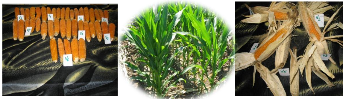
Figure 3. Pop Corn. Kecskemeti Gyongy

So, in the not irrigated system of culture can be observed significant values of the aspartic acid, proline, alanine, leucine, thyrozin, phenilalanin and arginine (g/100 g S.U). In the irrigated system of production, the content at 100 g s.u., presents significant values at the same amino acids, existing a significant difference at the amount of amino acids, as well as essential amino acids of almost 300g, and at hectare the difference is of about 7,8 kg/ ha at essential amino acids.