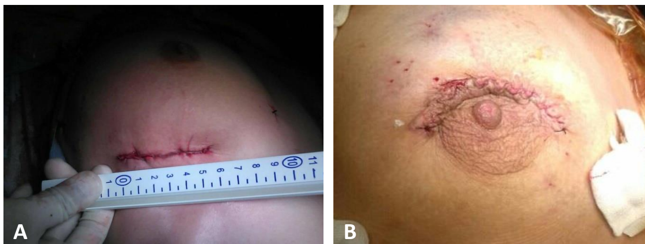
Figure 2: Right mini-thoracotomy via: A) infra-mammary 6-cm incision, B) Periareolar incision