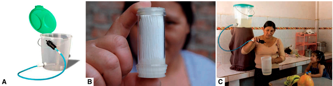
FIGURE 1. (A) The PointONE Filter produced by the Sawyer Corporation attached to a bucket with a lid was used in this study. (B) A transparent version of hollow fiber filter cartridge located within the filter casing. (C) A PointONE Filter bucket system in use and modeled for depiction in the filter training manuals used in the study.

The Sawyer PointONE (Sawyer Corporation, Safety Harbor, FL) is a POU filter that allows water to gravitationally flow into a 0.1- \mu\text{m} porous hollow fiber membrane bundle (Figure 1). This filter is attached to a hose that is coupled to a bucket in which unfiltered water is housed. An independent study testing three filter units in triplicate found that this filter system was successful in removing 5 log all protozoan parasites ( Giardia lamblia and Cryptosporidium parvum ) and 6 log bacteria ( Klebsiella terrigena ) tested in the laboratory. 17 Filter flow rates reported by the Sawyer Corporation range from 32.8 to 99.2 L/hour depending on variables such as head pressure, altitude, and unit variability. 18 Filter clogging can also affect flow rates. However, a backflow syringe that is provided with each unit makes cleaning easy and intuitive.