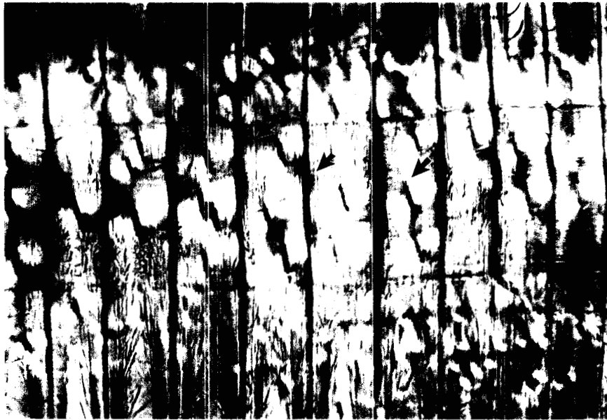
FIG. 4. Ultrasonically treated for two hours on section from low fibril angle Sample A showing checks and pits in ray cross field. The arrows are pointed to the vertical checks. Note that the angles of the checks in respect to the fiber axis are lower than those of the pit aperture ( 450\times ).

where the fibrillation was insignificant. In a ray cross field, the angles of orientation of the checks were found to be slightly lower than the angles of the pit apertures (Fig. 4). The ultrasound check-inducing technique was observed to be most effective on southern pine fibers with larger diameters and high fibril angles. Checks in fibers with high fibril angles are helically curved, narrow, and closely spaced, while the checks in fibers with low fibril angles are straight, wider, and widely spaced.