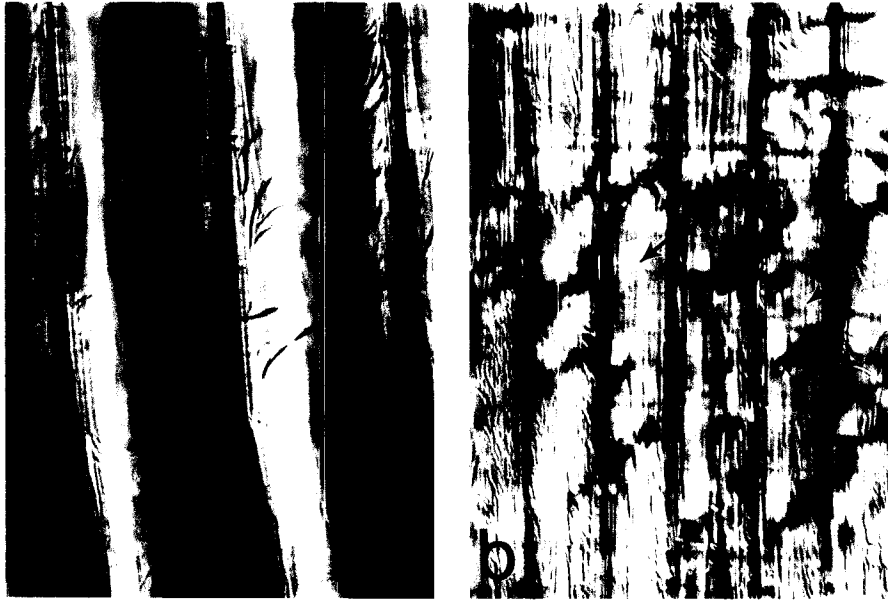
FIG. 1. Radial sections of low fibril angle Sample A ultrasonically treated for two hours and photographed using polarized light microscopy. (a) Earlywood. (b) Latewood. (450 \times ). The arrows are pointed to the checks in S2 layer. Note that the checks in the latewood fibers are almost parallel to the longitudinal axis of the cell.