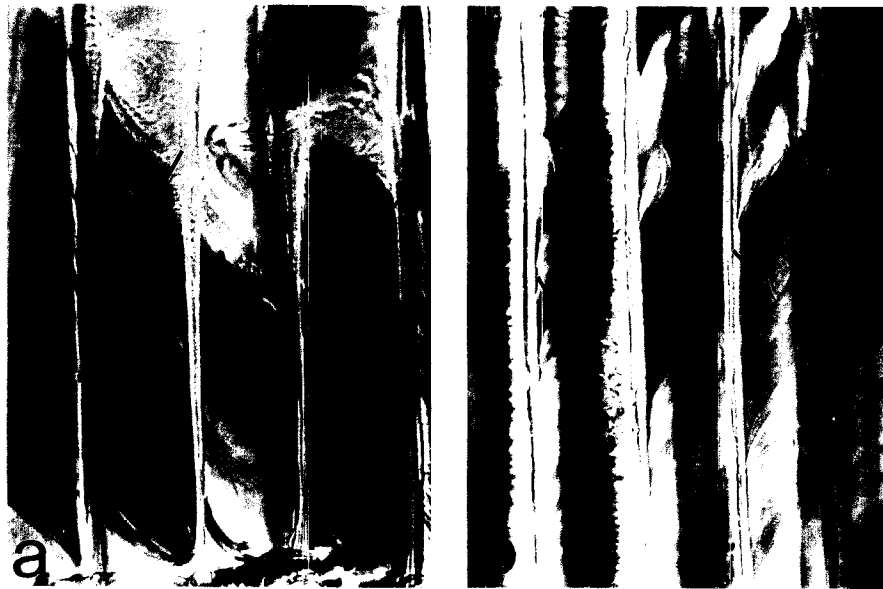
FIG. 2. Radial sections of high fibril angle Sample B ultrasonically treated for two hours and photographed using polarized light microscopy. (a) Earlywood. (b) Latewood. (450 \times ). The arrows are pointed to the checks in S2 layer. The microfibrils appeared curved near the edges of the cell walls of both earlywood and latewood fibers.