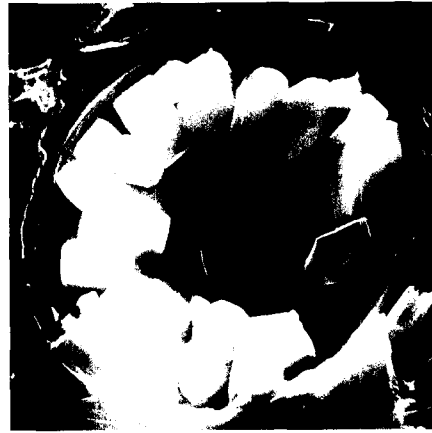
FIG. 1. Scanning electron micrograph of salt crystals within a bordered pit from sapwood of Douglas-fir (4000 \times ) exposed to salt water.

a Values represent means of 4 blocks per section for the sapwood and outer heartwood; for the inner heartwood, values represent 1 block per section. Values in parentheses represent one standard deviation.