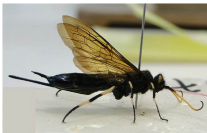
Fig. 5.— Urocerus albicornis emerged female from infested logs.