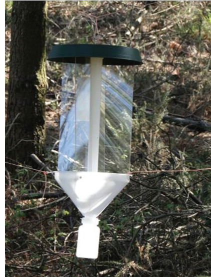
Fig. 1.— Flight trap.

Siricids were collected at each site with three interception traps baited with Contech Inc. Sirex lure ( \alpha - \beta pinene) plus 95% high-release ethanol (Fig. 1). Flight traps were used because it is suggested that they outperform Lindgren funnel traps in capturing large bodied insects, such as siricids (Johnson et al. , 2009). The traps were 70 cm long and 25 cm wide and hung 1 m above the ground. Trapped specimens were captured in propanodyol in a collection container at the bottom of the trap. Traps were placed approximately 40 m apart at each site. Trapping was initiated from late April to early December in 2011 and 2012. Trap catches were collected every two weeks until early December in both years. Lures were changed according to manufacturer recommendations, approximately once every 4 weeks.