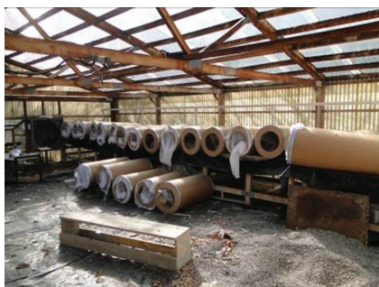
Fig. 3.— Emergence traps.