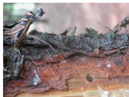
Fig. 2.— Emergence holes of Urocerus albicornis .

Emergence traps: From the stands where the traps were set up, I examined large numbers of dead and dying trees for symptoms of occupancy by Siricidae. In January 2012, 10 fallen logs were selected from each sampling site (60 logs total), with emergence holes that could have been produced by siricids according with Ayers et al. (2009) (Fig. 2). The logs were transported to a covered storage building without heating and introduced individually into hard paper barrels opened with an entomological cloth (Fig. 3). The barrels were checked twice a week from late March to the end of June, and all the insects