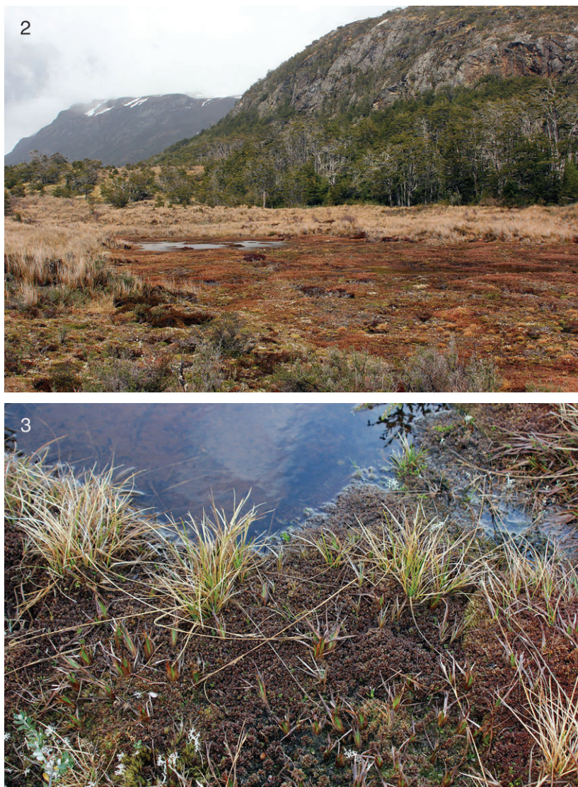
Figs. 2-3.— 2) The type locality, a small mountain meso-oligotrophic non-forested sphagnum bog surrounded by open woodland. 3) The habitat of the new genus, Tetroncium magellanicum - Sphagnum magellanicum association forming a carpet community predominated by Sphagnum magellanicum (the photo illustrates the exact point of sampling of the new genus).

Figs. 2-3.— 2) Localidad tipo, una pequeña montaña, no boscosa, con turbera meso-oligotrófica rodeada de bosque abierto. 3) Hábitat del nuevo género: asociación Tetroncium magellanicum - Sphagnum magellanicum que conforma una comunidad con predominio de Sphagnum magellanicum (la foto muestra el punto exacto de la toma de muestras del nuevo género).