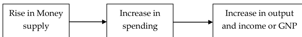
Figure 2.2: Monetarists' Monetary Transmission Mechanism

Monetarist views the relationship between the quantity of money and national income as more stable, because, like the classical economists they believe that the velocity of money is nearly constant in the short run. In a diagrammatic and equation forms, the monetarists' monetary transmission mechanism are shown in figure 2.2 and equation respectively.