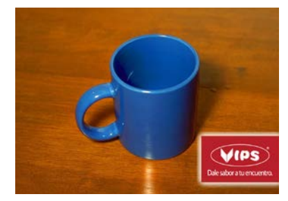
Lang, (IAPS) No. 7009 image, inserting self-realization brand