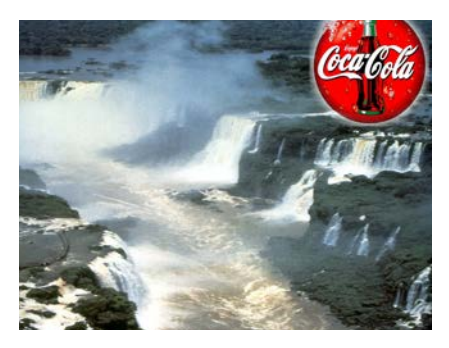
Lang, (IAPS) No. 5260 image, inserting self-realization brand