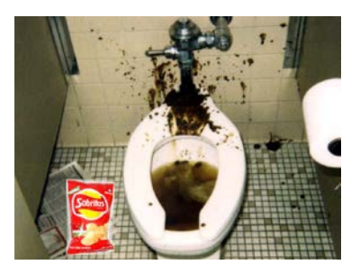
Lang, (IAPS) picture No. 9301, carrying brand insertion own.