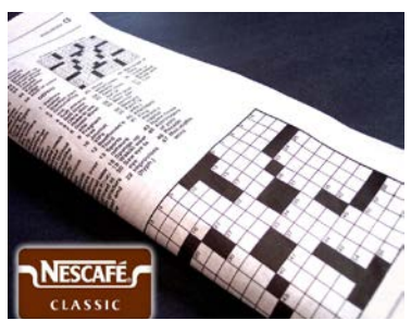
Lang, (IAPS) No. 7061 image, inserting self-realization brand