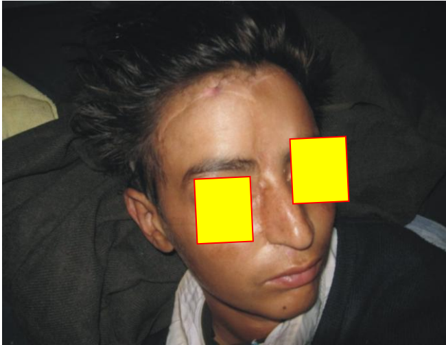
Fig 1: Post op picture of patient showing scars of Lateral Rhinotomy and Frontal Craniotomy.