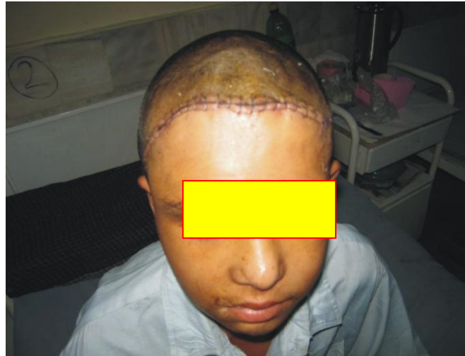
Fig 2: Post op picture of the patient showing scar of Frontal Craniotomy.