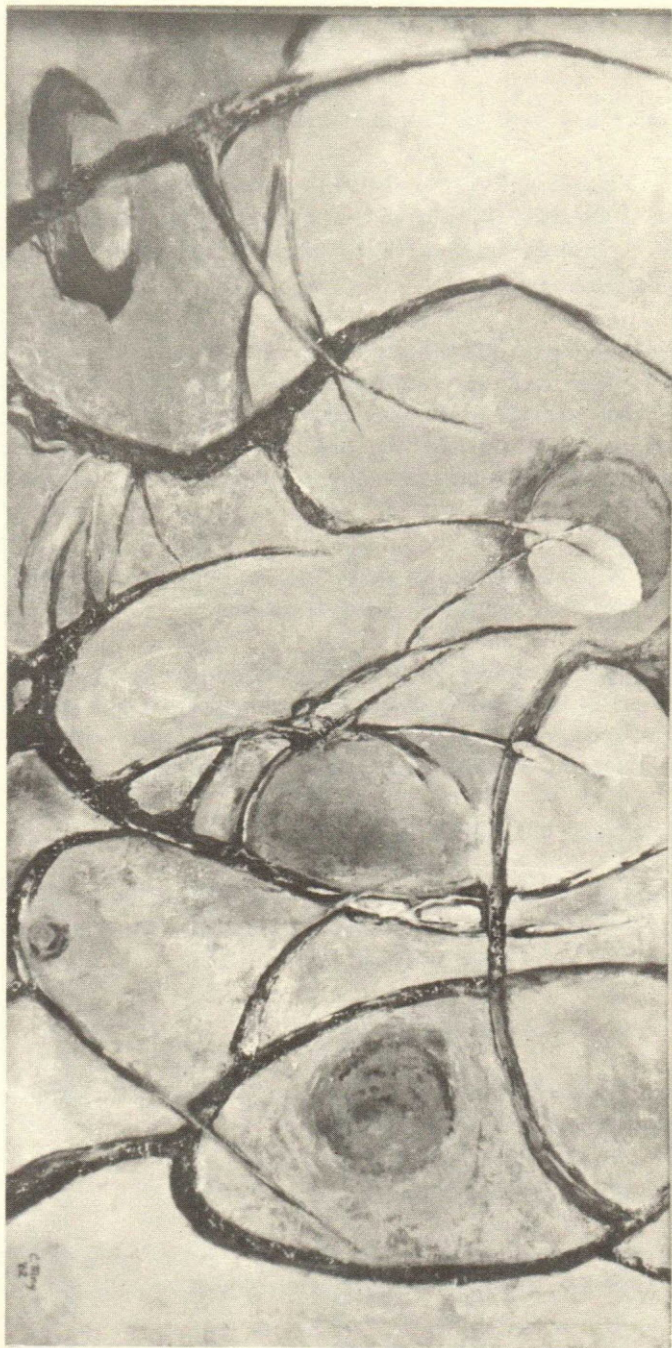
Cecilia May, Primavera , Oil, 4' x 2'