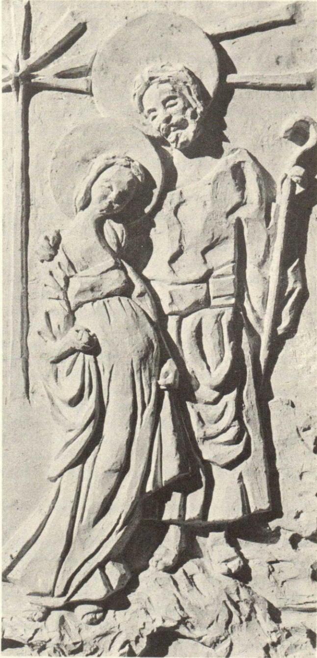
Cecilia May, Incarnation , Bas Relief in Clay, 8" x 17"