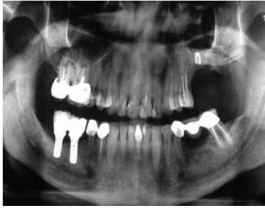
Fig 6. OPG showed broken implant in the UL6

Case No 2: A 50 years old man also complained of broken implant in the UL6. The implant size was 4mm bone level, and the X-ray showed broken implant. After a careful assessment, the patient was found to had night bruxism and strong biting with fracture restoration. Hence, the increase para function and malocclusion in the jaws movement resulted to fracture after two years from the implant time. However, the fractures pieces were removed (Fig. 6-7).