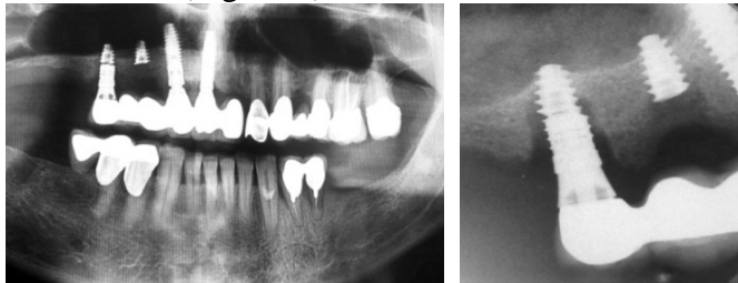
Fig 8, 9. Showed the broken implant

Case No. 3: A 45 years old male patient came to our centre with complaints of mobility in his bridge at the upper right arch. The bridge supported implant was made for him seven years ago with four implants. The patient had severed grinding and hard biting. Nevertheless, clinical examination revealed mobility in the upper right 6 area implant. X-ray showed implant fracture (Fig 8-11).