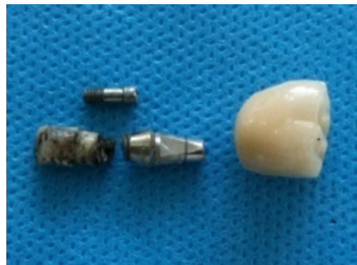
Fig 4,5. Removal of the broken implant

After the examination of the broken implant, it showed that the implant was small in diameter and the biting force concentration on the weakest part of implant uneven distribution of forces caused the fracture.