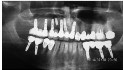
Fig 11. Implanted with a new implant with more support