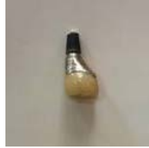
Fig 7. The broken implant with a crown

The possible cause for the broken implant was the weakness of the implant size against the biting force and the bruxism. Vertical/horizontal biting movement also affected the implant stability.