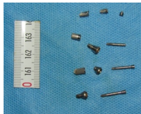
Fig 10. Removal of the broken implant and the other bridge support abutment and loss implant