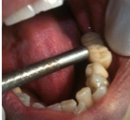
Fig 2. Mobility in the Implant